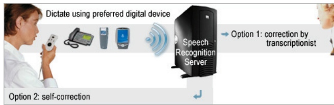
Back-end speech recognition workflow

When implemented as a back-end layer, the system is fully transparent to authors, who may not even be aware that speech recognition technology is being used. As soon as the dictation is complete, the document is immediately made available to the transcriptionist for correction.