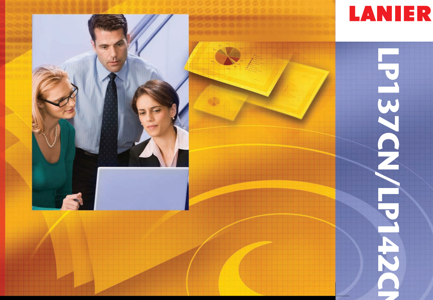
An extraordinary printer for all your ordinary printing needs.

Regain control over quality, workflow, and cost.