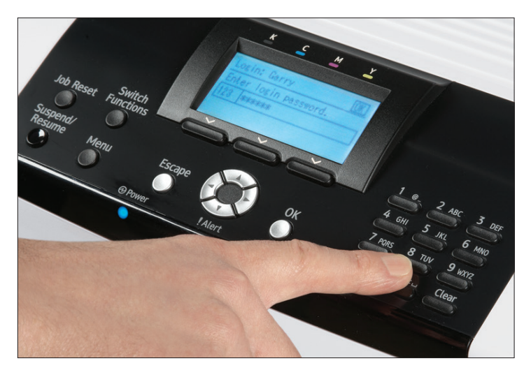
Locked Print* enables secure, password-protected printing. The LP137CN/LP142CN Control Panel includes a 12-key alphanumeric keypad to make entering passwords easier. *Standard on Lanier LP142CN.