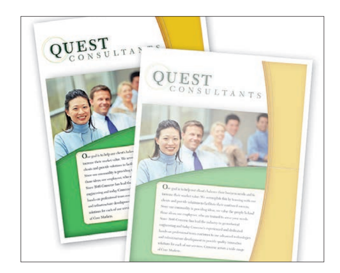
Economy Color mode lowers color printing costs without sacrificing quality.