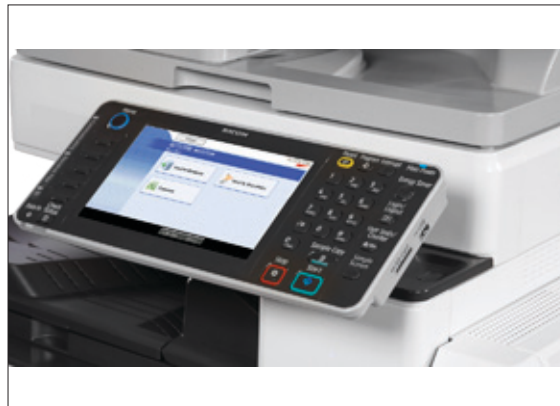
AutoStore works seamlessly with all Lanier devices, including MFPs and networked scanners and copiers.