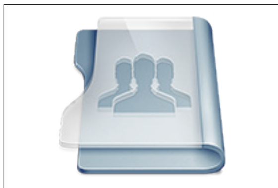
Access company email and fax lists directly at the MFP control panel to accelerate distribution throughout your organization.