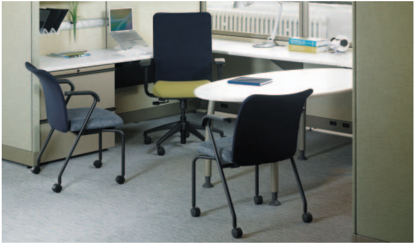
Essentials Tech Task chair, opposite, with Navy suspension back and upholstered seat in Stacks , Wave with the complementary arm and armless Side chair with seat cushion in Ingot , Citrine .