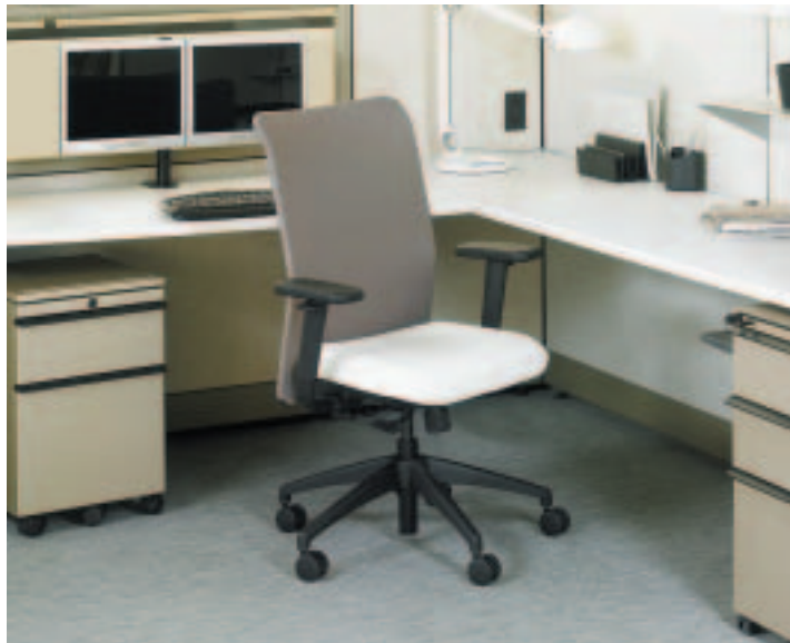
Complementing a light aesthetic, the Essentials Tech Task chair is shown bottom left with a Beige back and Spinneybeck Volo , White leather upholstered cushion. Shown here in a Morrison workstation.