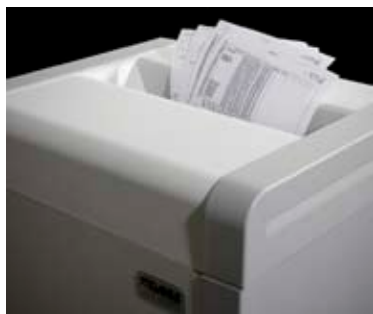
Contemporary wooden cabinet houses shredded waste and deafens noise for quiet operation.

Confidential information can be found in many different formats, so why not have a shredder that can destroy them all? With this in mind, Dahle's developed a new generation of shredders that can destroy more than just paper. The 30406 & 30414 Multi+Media Shredders are designed to shred between 2,000 and 8,000 sheets of paper per day as well as CDs, DVDs, and floppy disks. The shredder's contemporary design and large storage capacity make them a nice addition to any large office, copy room or communications center.