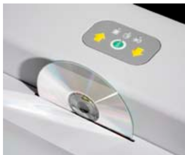
Able to shred multiple media formats such as CDs, DVDs, and floppy disks.