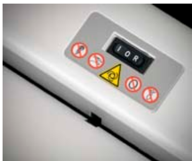
State-of-the-art electronics conveniently turns the shredder on when shredding and then off.