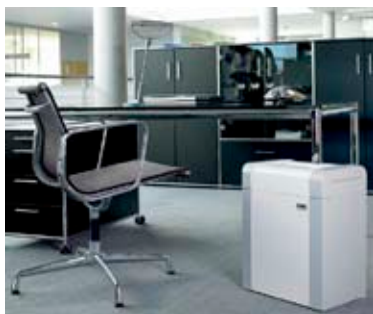
Desk side placement makes it easy to shred without leaving your workstation.

It's all about convenience with a Dahle Personal Shredder. Whether you're an executive, a secretary, or someone looking for added security at home, these machines are small enough to accommodate any workspace yet powerful enough to get the job done. Dahle's smallest line of shredders are designed for shredding up to 100 sheets of paper per day and are perfect for destroying bank statements, credit applications and financial records. These shredders can be conveniently placed at arms length so you never have to leave your desk to properly dispose of confidential documents.