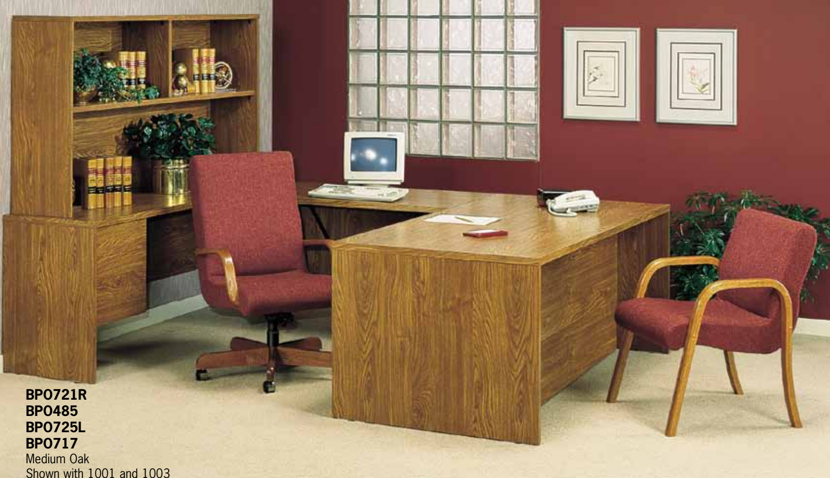
BPO721R BPO485 BPO725L BPO717 Medium Oak Shown with 1001 and 1003