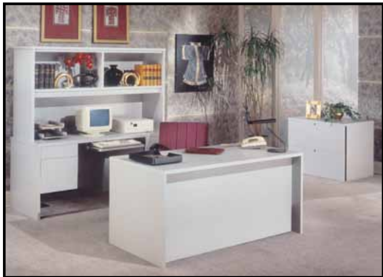
BPG660 BPG644 BPG617 BPG346