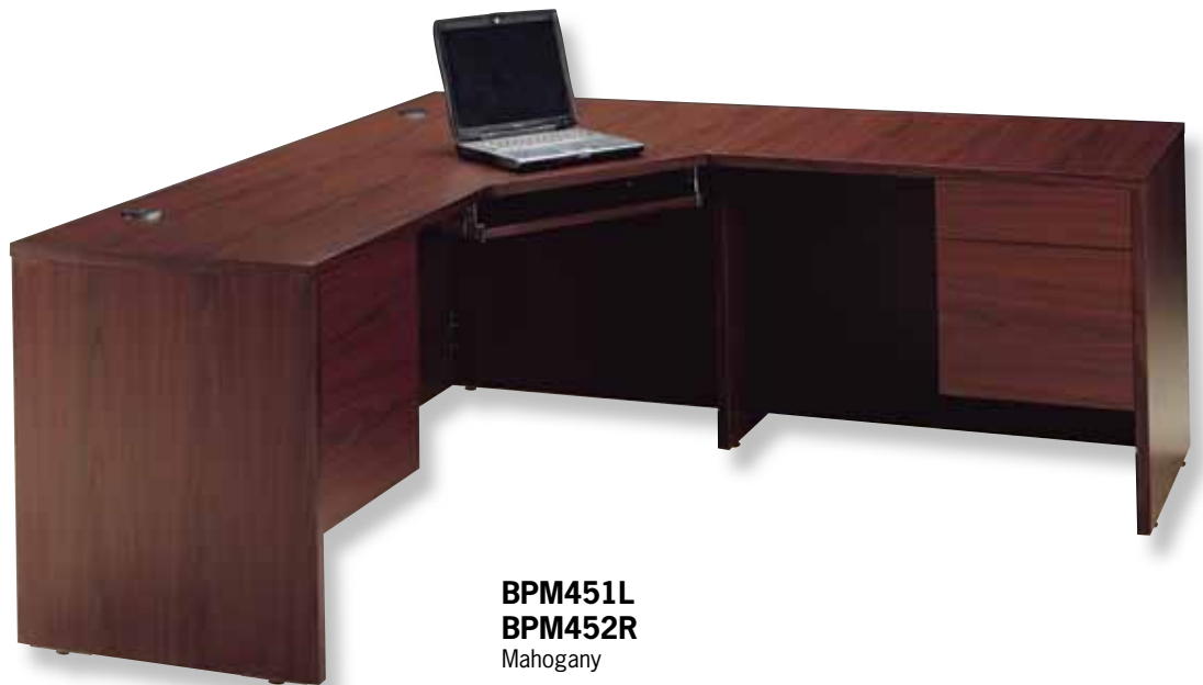
BPM451L BPM452R Mahogany

Computer Corner Station includes locking pedestals, keyboard platform and wire management grommets.