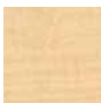
FM Natural Maple