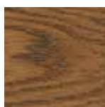
O Medium Oak