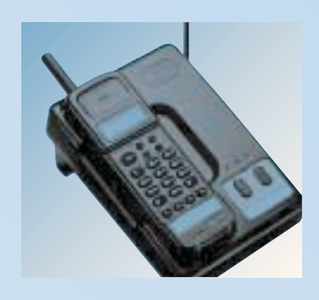
IX-DCKT900 900 MHz Digital Wireless Telephone