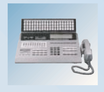
IX-ATT Attendant Console with IX-BLF Busy Lamp Field