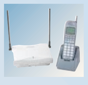
Omegatrek IX-PS6 Digital Wireless Portable Station and IX-BS5 Base Station