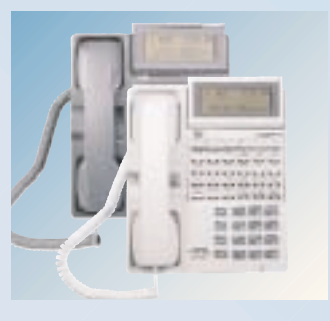
IX-12KTD-2 Digital Display Key Telephone with IX-12ELK 12-Key Expansion Unit