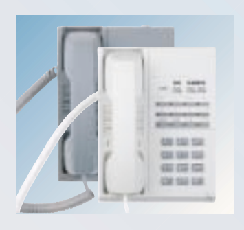
IX-MKT Digital Key Telephone