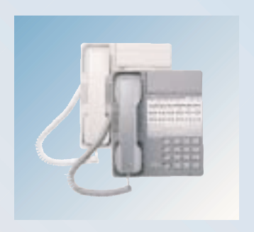
IX-12KTS-2 Digital Key Telephone Available in ash or gray