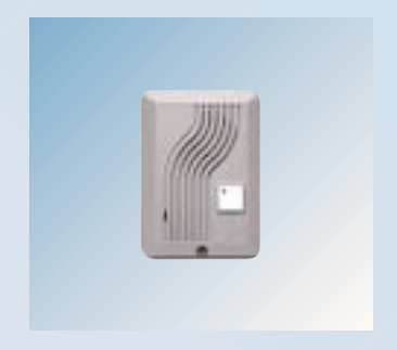
IX-DDPH Digital Doorphone