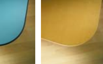
Universal wood veneer worksurfaces