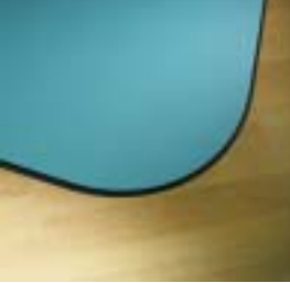
Universal laminate worksurfaces